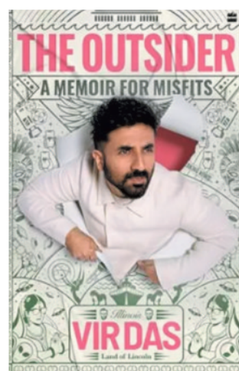
The Outsider: A Memoir For Misfits by Vir Das Published by Harper Collins 255 pages, ₹699